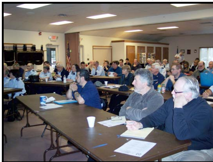
Members taking advantage of exceptional workshop presentations

NEW MEMBER/ALL MEMBER WORKSHOP PRESENTATIONS ON THE DIVISION WEB SITE: