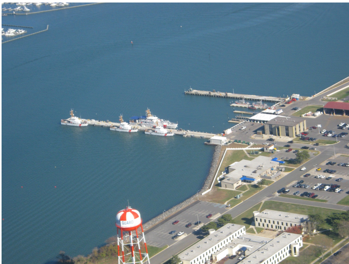
Flyover of Station CAPE MAY from an AUXAIR flight