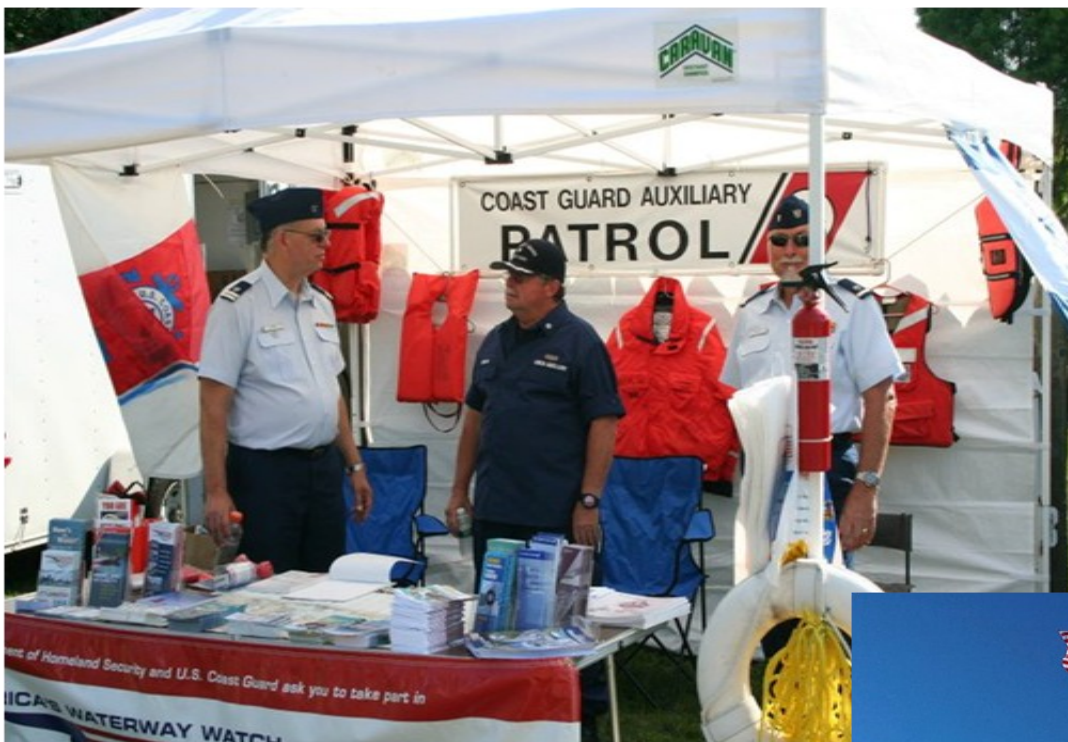
Flotilla 16-05 at Wooden Boat Festival

We have participated in 51 Public Affair events, we have 50 Instructors, 49 VE's and 19 PV's. We have provided a total of 1994 hours of Operation support to the Coast Guard and 480 hours of Marine Safety awareness. One of our primary objectives is growth through recruiting and Public Affair events. We may be small, but we are very proud of our accomplishments and of our support to the Coast Guard.