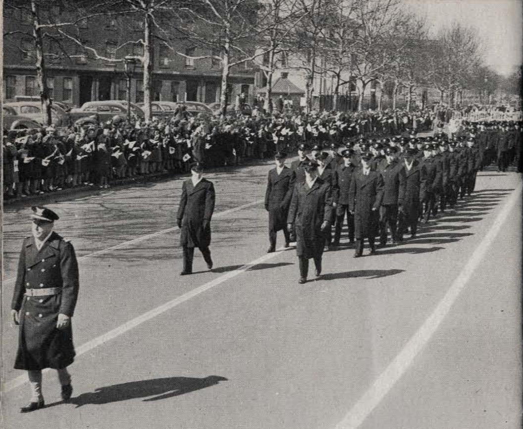
RESERVISTS OF FLOTILLA 25 PARADE IN RED CROSS DRIVE