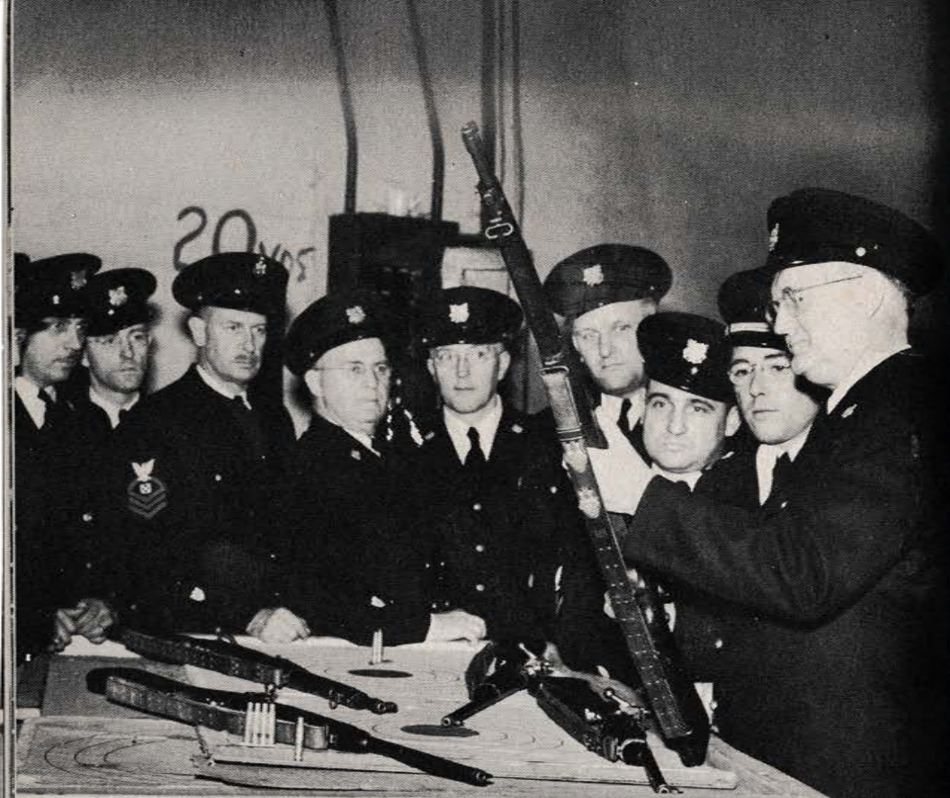
GUNNERY INSTRUCTION AT FLOTILLA 51