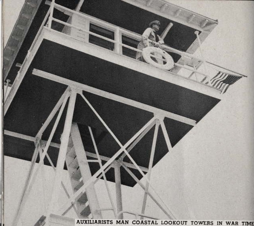
AUXILIARISTS MAN COASTAL LOOKOUT TOWERS IN WAR TIME