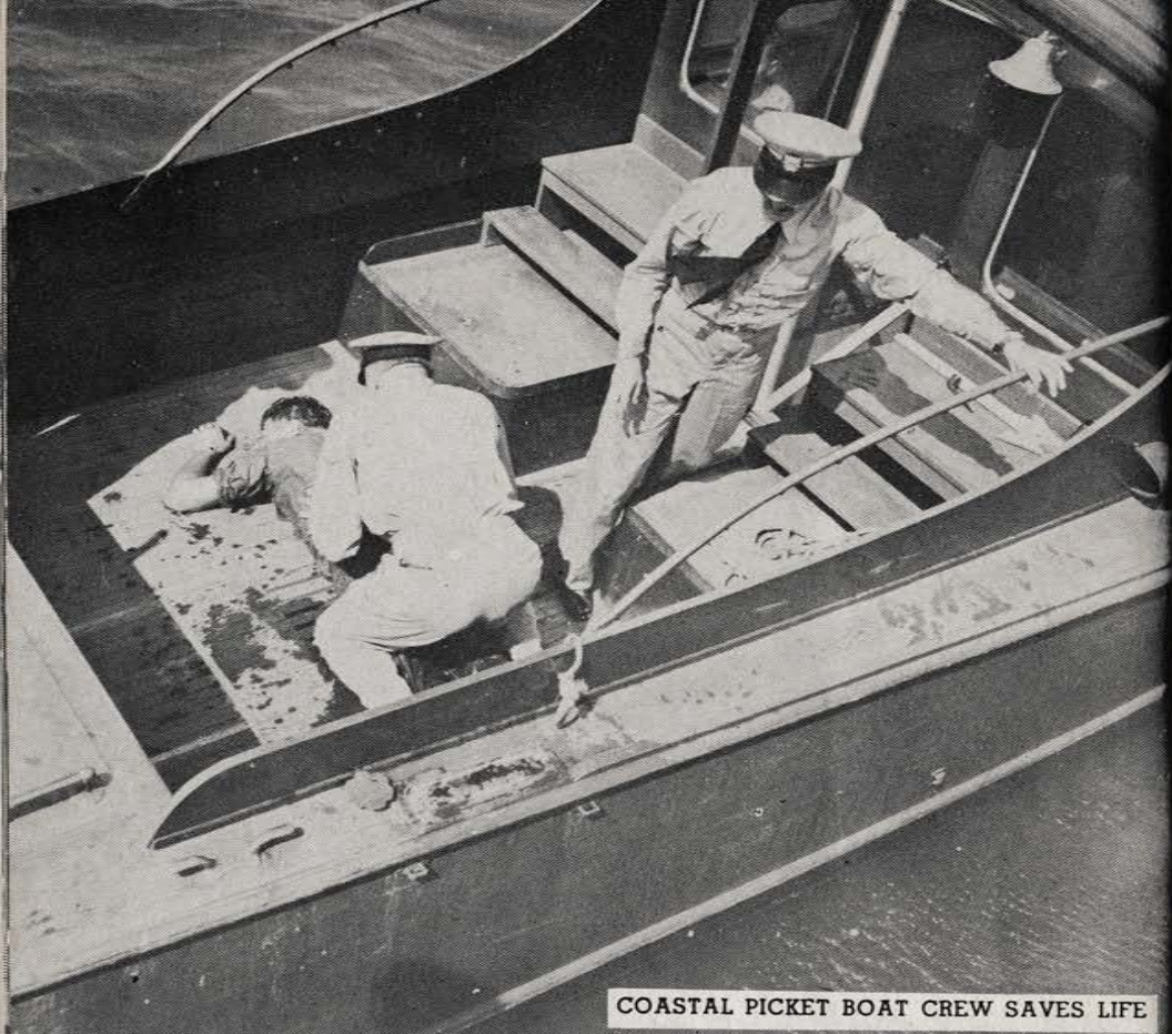
COASTAL PICKET BOAT CREW SAVES LIFE