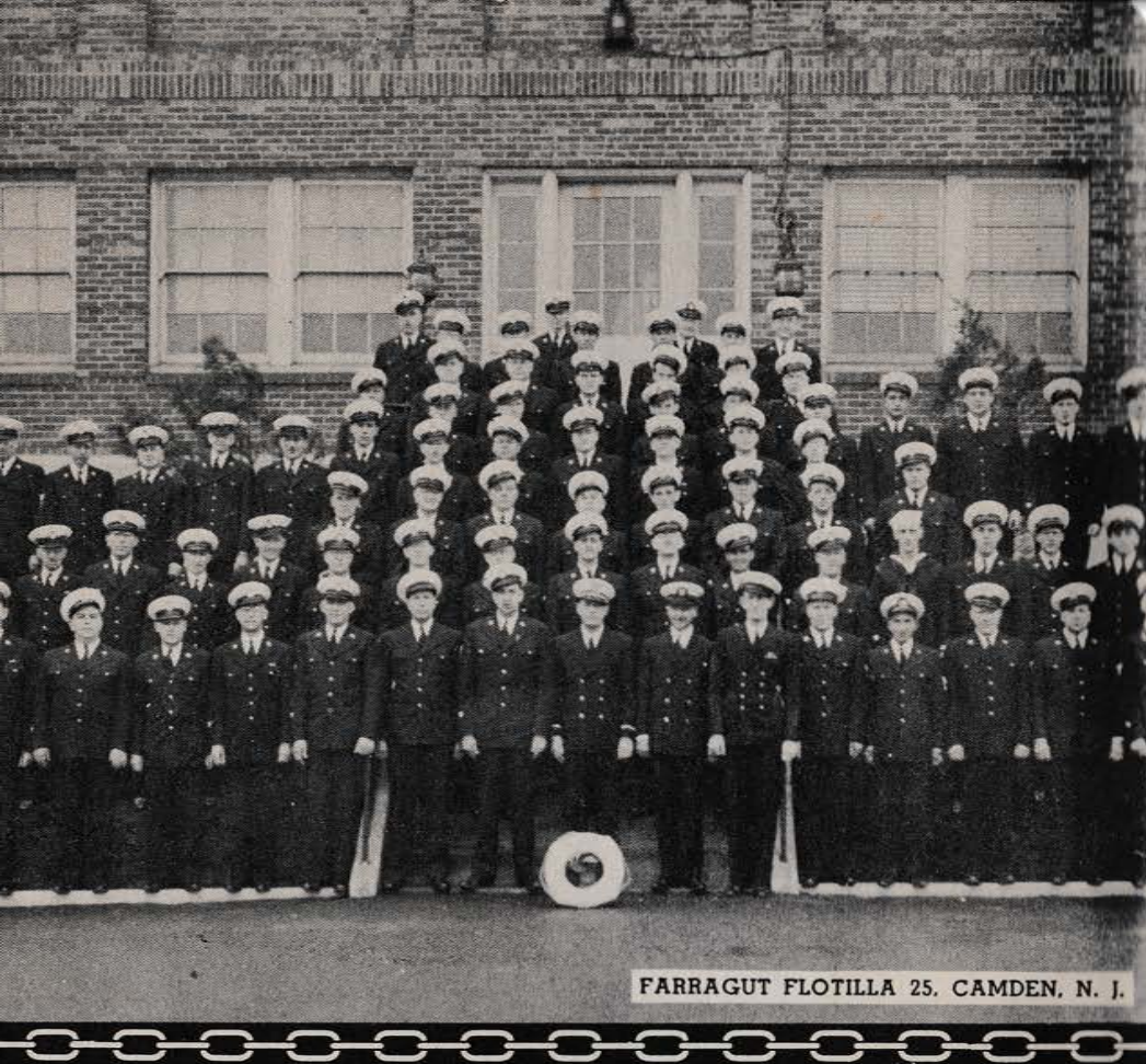
FARRAGUT FLOTILLA 25. CAMDEN, N. J.

IF YOU are a male American citizen over 18 years of age YOU are interested in the opera- tion of boats, airplanes, or radio communications YOU wish to be of direct assist- ance to your Government YOU want to actively aid the U. S. Coast Guard Then, you should join the U. S. Coast Guard Auxiliary