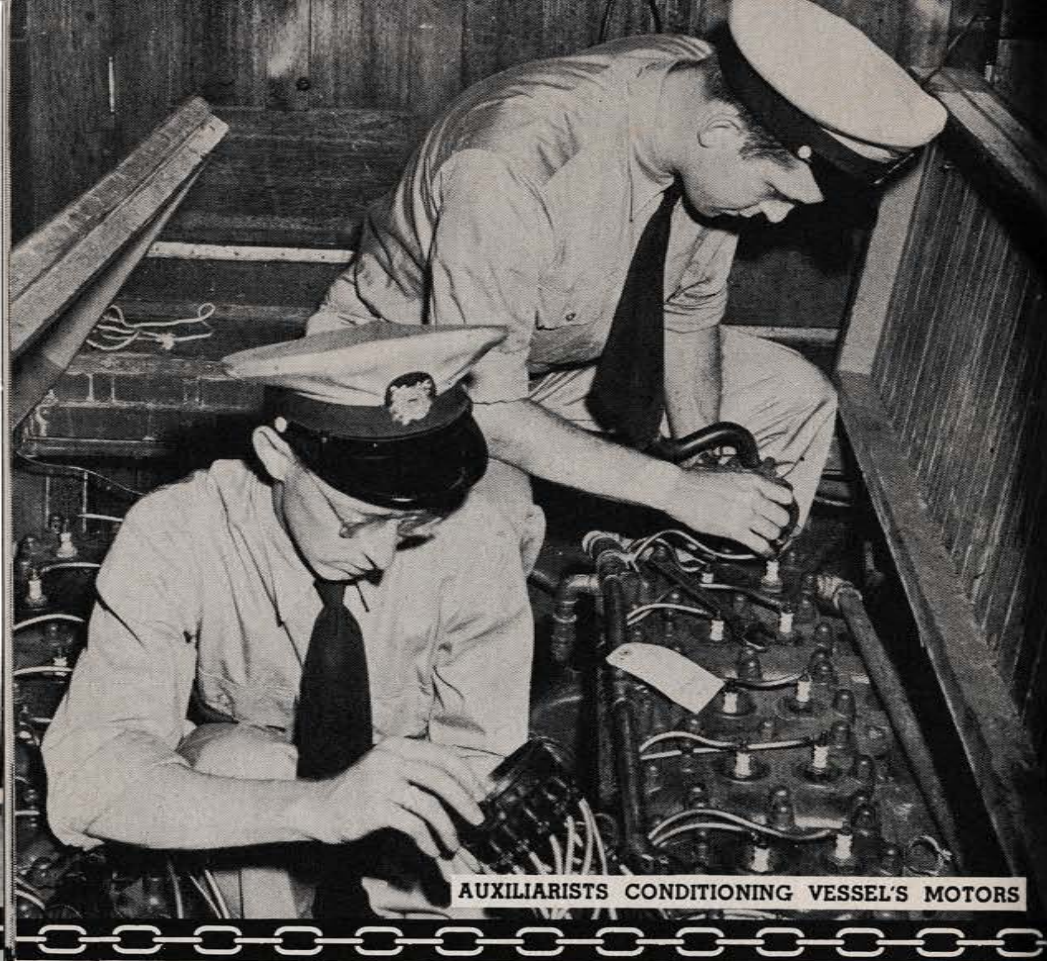
AUXILIARISTS CONDITIONING VESSEL'S MOTORS