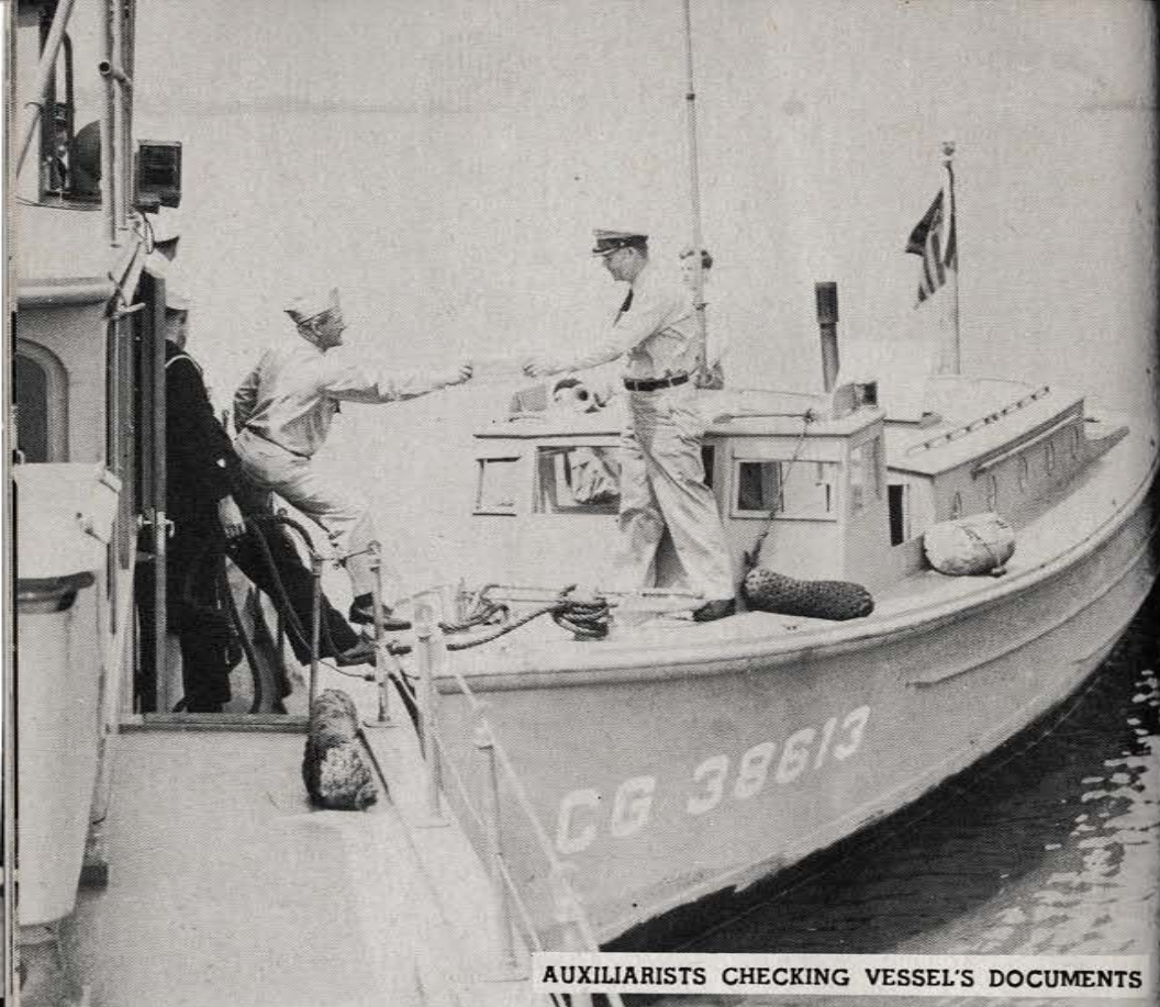
AUXILIARISTS CHECKING VESSEL'S DOCUMENTS