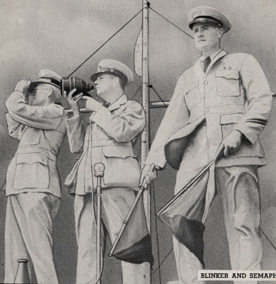
BLINKER AND SEMAPHORE