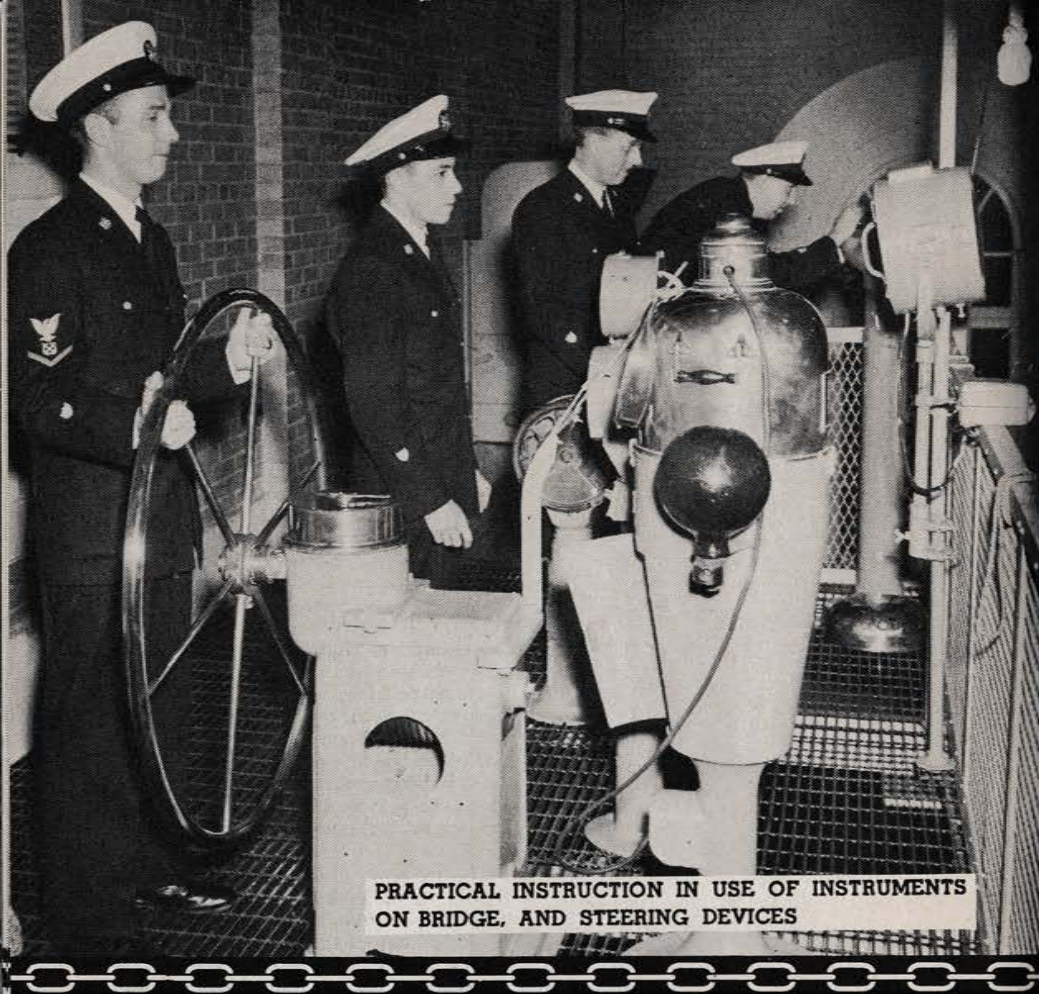
PRACTICAL INSTRUCTION IN USE OF INSTRUMENTS ON BRIDGE, AND STEERING DEVICES