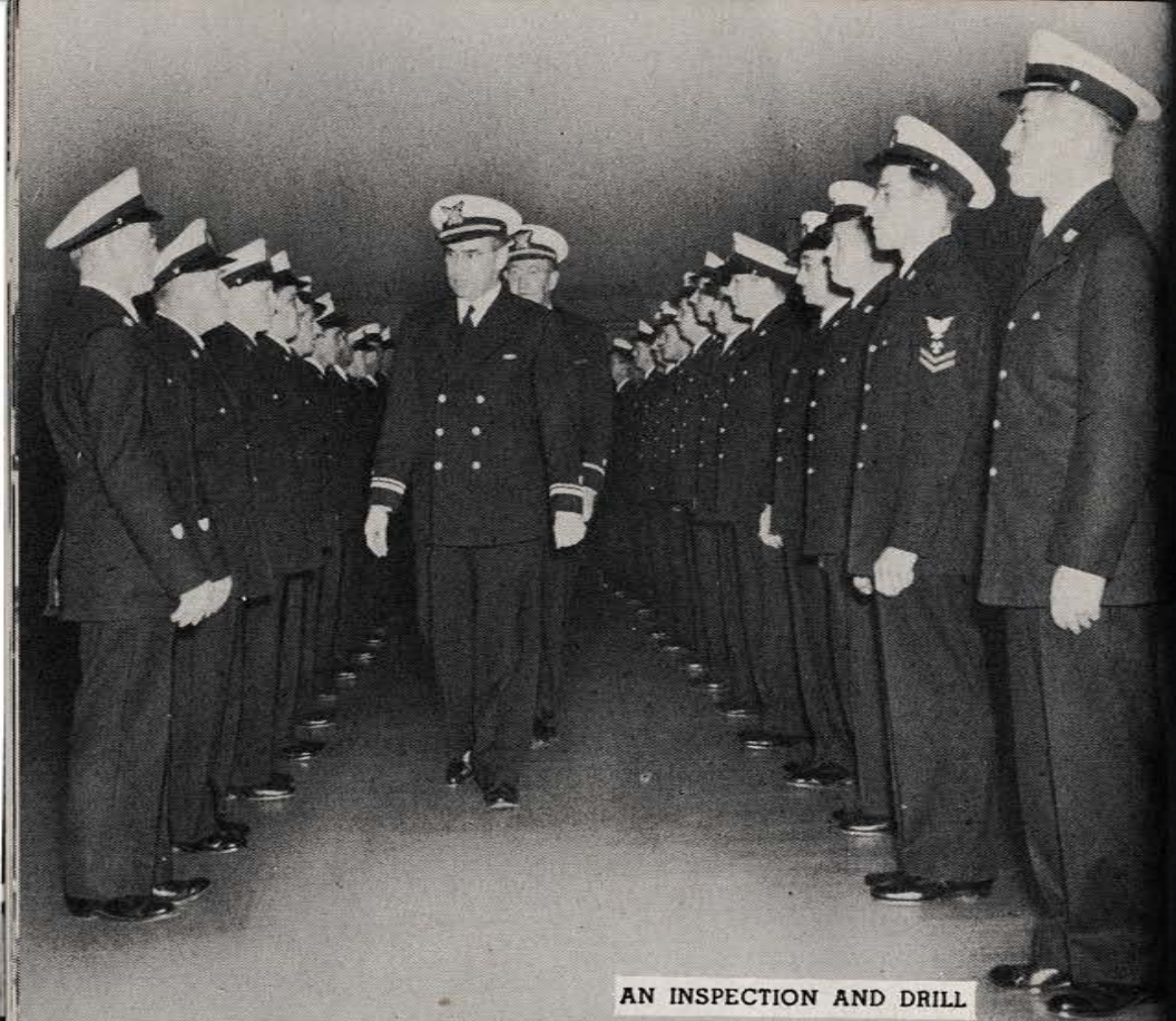
AN INSPECTION AND DRILL