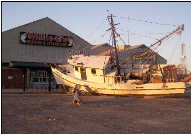
Commercial Fishing Boat washed ashore in a parking lot 100 yards inland.

I received a call from FEMA at 4 PM on Wednesday afternoon (Sept.10) to be in Atlanta, GA headquarters for a 1 PM meeting on Thursday (IKE made land fall Friday) The flight confirmation and ticket, car rental and lodging was sent to me by e-mail that evening and at 6 AM I departed from Atlantic City and made the noon meeting for briefing and interim training.