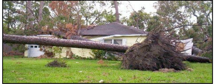
Downed trees were commonplace in residential areas.

because there was no electricity as well as no replacement parts for traffic lights. 2.1 million people were without electric on September 13. Four weeks later the electric power was back to normal.