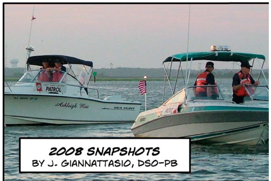
2008 SNAPSHOTS BY J. GIANNATTASIO, DSO-PB