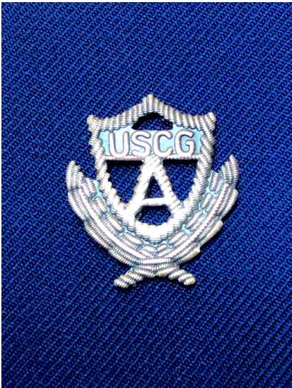
Original version of the Past Officer Device. (1976 - present).

In 1972, Commandant of the Coast Guard Admiral Chester R. Bender introduced a new set of blue uniforms for wear by all Coast Guard personnel, which were also adopted by the Auxiliary. Unlike Navy uniforms, the new "Bender's blues" uniforms made few distinctions between officers and enlisted personnel, with all ranks generally wearing the same style of uniform (with the exception of a few formal uniforms reserved for officers only). The Auxiliary sleeve insignia was replaced by shoulder boards of black cloth background, silver button, silver lace stripes and shield. Past officers were indicated by unique shoulder boards that incorporated the newly authorized Past Officer Shield - a silver shield with a wreath on the lower sides of the shield. In the 1980s the Auxiliary shoulder board background color was changed to the current shade of blue adopted by the Coast Guard when they changed uniforms.