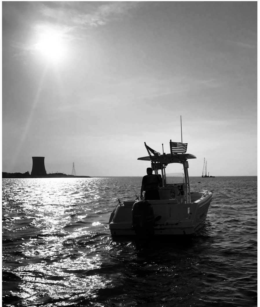
GREAT EGG HARBOR BAY, NJ - "SilverSky" A Coast Guard Auxiliary Division 08 vessel underway against sunset.