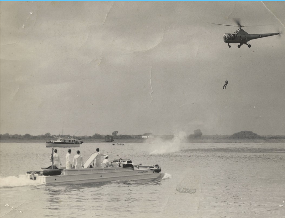
CAPE MAY, NJ - A Coast Guard HO3S helicopter lowers a rescue swimmer as a Coast Guard Auxiliary vessel (in background) and a Coast Guard DUKW amphibious boat looks on during 5NR's first DCON (District Convention) hosted by Division 8 on August 4, 1949.