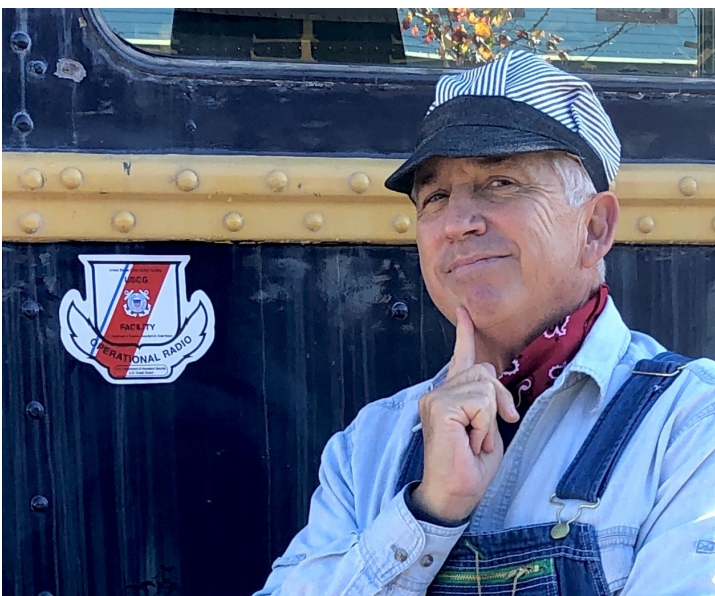
An Auxiliary Mobile Radio Unit caboose? Why not!