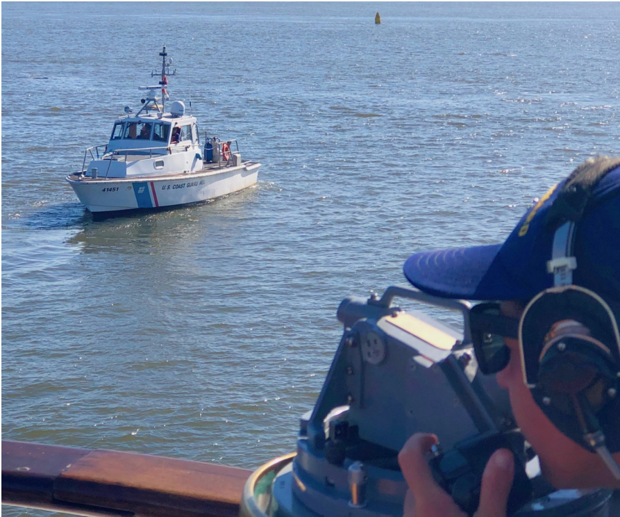
DELAWARE RIVER - A Coast Guard Officer Candidate looks through a pelorus aboard the Coast Guard cutter Eagle transiting the Delaware River as a Coast Guard Auxiliary 41-foot Utility Boat from District Fifth Northern provides escort.