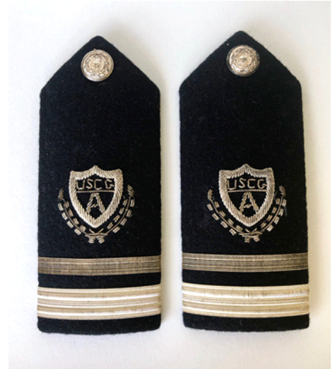
Shoulder board Insignia for Past Vice Flotilla Commander. (1972-1976) [Note Past Officer Shield.]

On March 29, 1976, the Past Officer device currently utilized was authorized to be worn on appropriate Auxiliary uniforms by past appointed or elected leaders according to policy. This device does not come with a red or blue "A" to distinguish past elected officers from appointed officers. The appropriate office insignia remains the distinguishing mark.