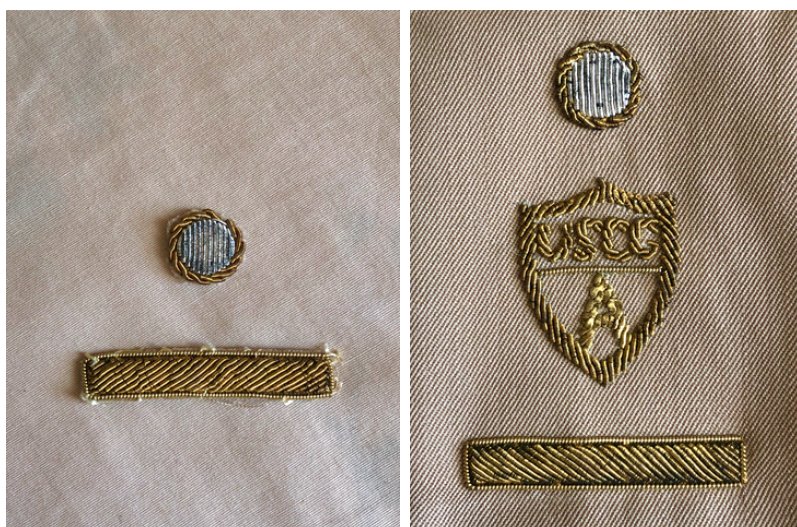
Left: Insignia for Past Flotilla Staff Officer. [left sleeve] (1939-1972)

Prior to 1972, all Coast Guard personnel, including Auxiliarists, wore the same uniforms as the United States Navy with distinctive Coast Guard insignia. Insignia for Auxiliary members were worn on the lower sleeves of their uniform and had only a gold embroidered outline of a U.S. shield with "USCG" above, and an "A" below. Flotilla Vice Commander (also Flotilla training officer) had the addition of a single bar of gold wire embroidery. Also of the same insignia attached to the flotilla was the flotilla staff officer, which has the same insignia design, but with a silver embroidered circle outlined with a gold border. These office insignias progressed up to four bars for a division captain (Now Division Commander), additional stars designated the levels of commodore with the embroidered circles indicating appointed staff officers at corresponding levels. These were only worn on the right sleeve.